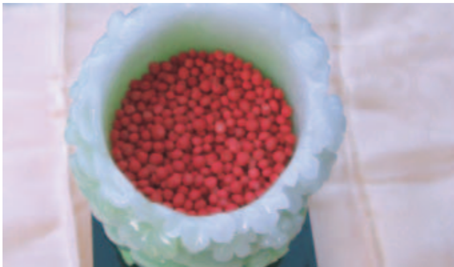
After the nectar pills were distributed to attendees and before dharma was practiced at the Food Offering Dharma Assembly, the bowl of nectar pills was not full. 在將金剛丸分發給參加法會的人之後而在上供法會修法之前，沒有滿的一鉢甘露丸。