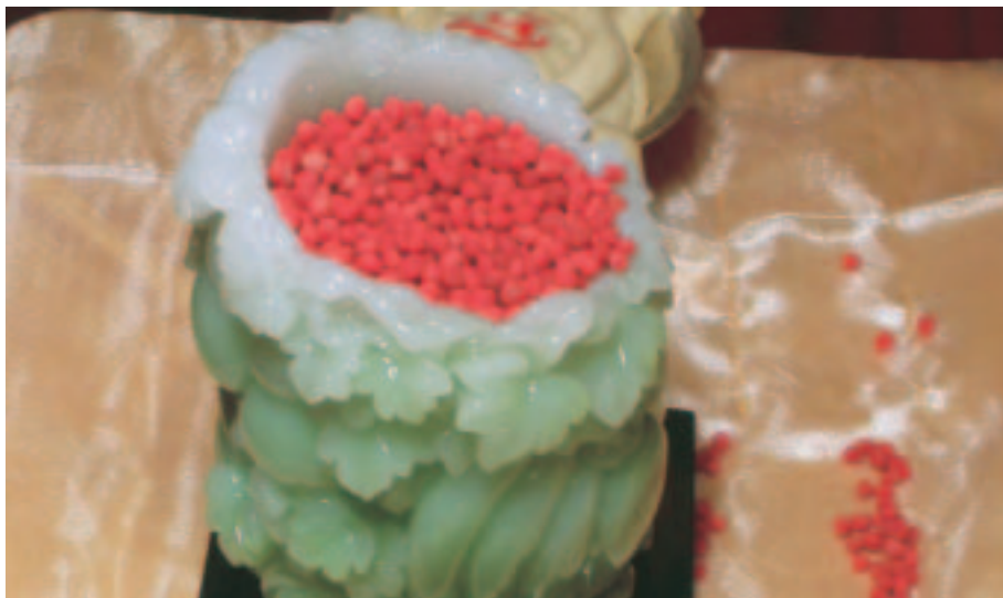
One hour later after dharma was practiced at the Food Offering Dharma Assembly, the nectar pills instantly grew in number, filling the entire bowl and lots of nectar pills dropt to the table. 上供法會修法一個小時之後，甘露丸剎那暴漲，漲平成了滿鉢，很多掉在法台上。

inside a jade bowl. At that time, the nectar pills were level with the lower edge of the brim of the bowl. Those nectar pills were piled up evenly and filled the entire bowl. The Buddha Master later empowered the fifty-nine attendees of that dharma assembly by giving each of them some of those nectar pills. As a result, the nectar pills that remained in the jade bowl were lower than the lower edge of the brim of the bowl by about 1.5 centimeters. We saw that the nectar pills neither lessened nor increased from 7:03 p.m. when the practice of the dharma began until around 8:10 p.m. when the offerings of the three karmas to the Buddhas was completed. At that time, a holy event nobody ever imagined suddenly took place. In an instant, the nectar pills grew in number. Not only did the pile of nectar pills rise more than 1.5 centimeters filling the entire bowl, its top part formed a dome that rose high above the brim. Everyone was ecstatic at the sight of that holy